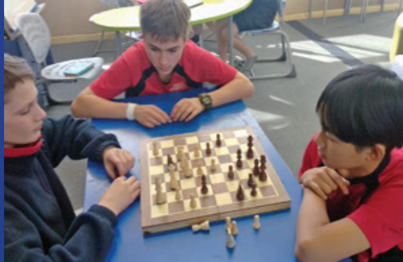
Chess, Year 7 and 8 South Island Champions