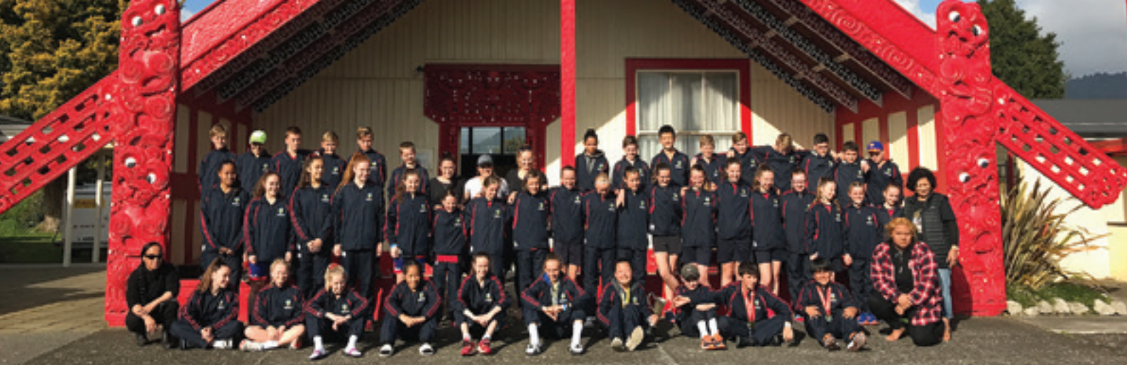
AIMS Games Athletes