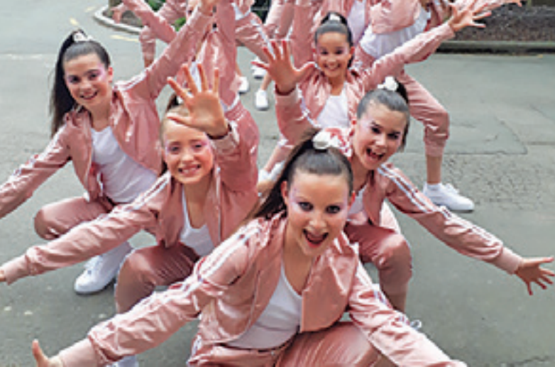
Jump Jam, 2nd at South Island Regional Competition