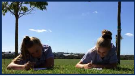
Students can relax and play in the park-like surrounds

Sancta Maria College is an architecturally award winning school campus built on 10 hectares of land. Its design provides a unique learning environment and utilises the latest modern class-room facilities with wifi technology throughout the school to enhance student learning. The classrooms are spacious and well-equipped, several of which have interconnecting computer pods. All of the classrooms open out to shared verandas and courtyards where students can work and play.