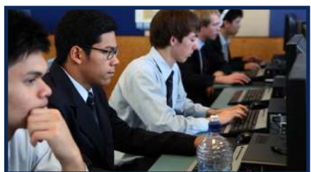
Designated computer labs