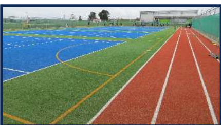
New tennis, hockey courts and running track