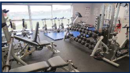
Large gymnasium with fitness room