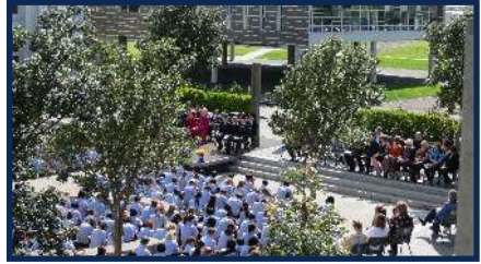
Learning outside the classroom