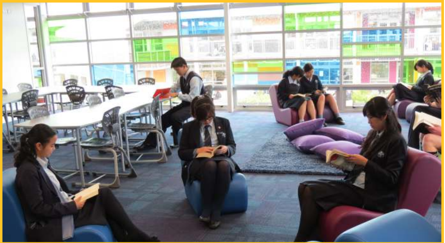
New library with reading and study room