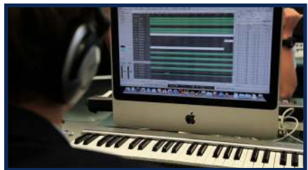
Well equipped music rooms with recording studio